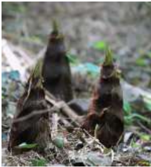
First Sprout after 272 Weeks

A person nurtured the bamboo for four years but nothing happened. There was no sign of growth. But, he did not give up on the tree and continued to nurture it. In the fifth year, the bamboo tree grew almost 90 feet tall within two months. Bamboo Tree is a symbol of resilience and perseverance.