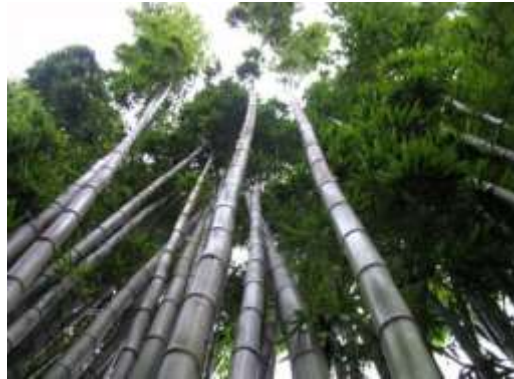
80 Feet Tall Bamboo Tree in next 8 weeks.

Small Disciplines repeated with consistency every day lead to great achievements gained over time.